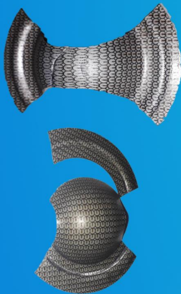
Specimen after the test