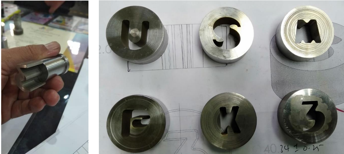
Fabricated puncher and die

This year, similar project was performed. In conjunction with 50 th USM anniversary, the blanking dies produced were related to that. The projects were posted in YouTube channel.